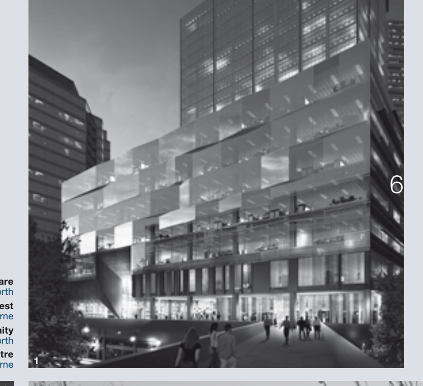
1. City Square Perth 2. Southern Cross West Melbourne 3. Vale Masterplan Community Aveley, Perth 4. Melbourne Convention Centre Melbourne